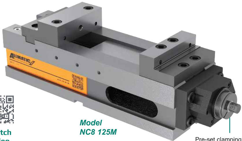
Model NC8 125M

Pre-set clamping force – no torque wrench required.